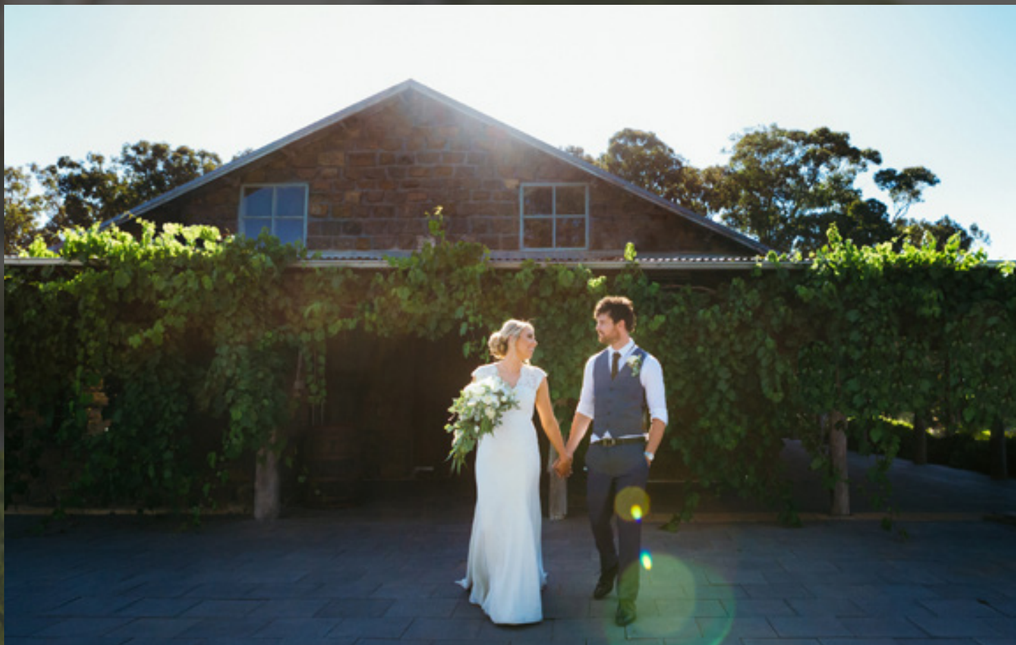
A BEAUTIFUL SUMMER DAY ON THE CHAPEL PATIO