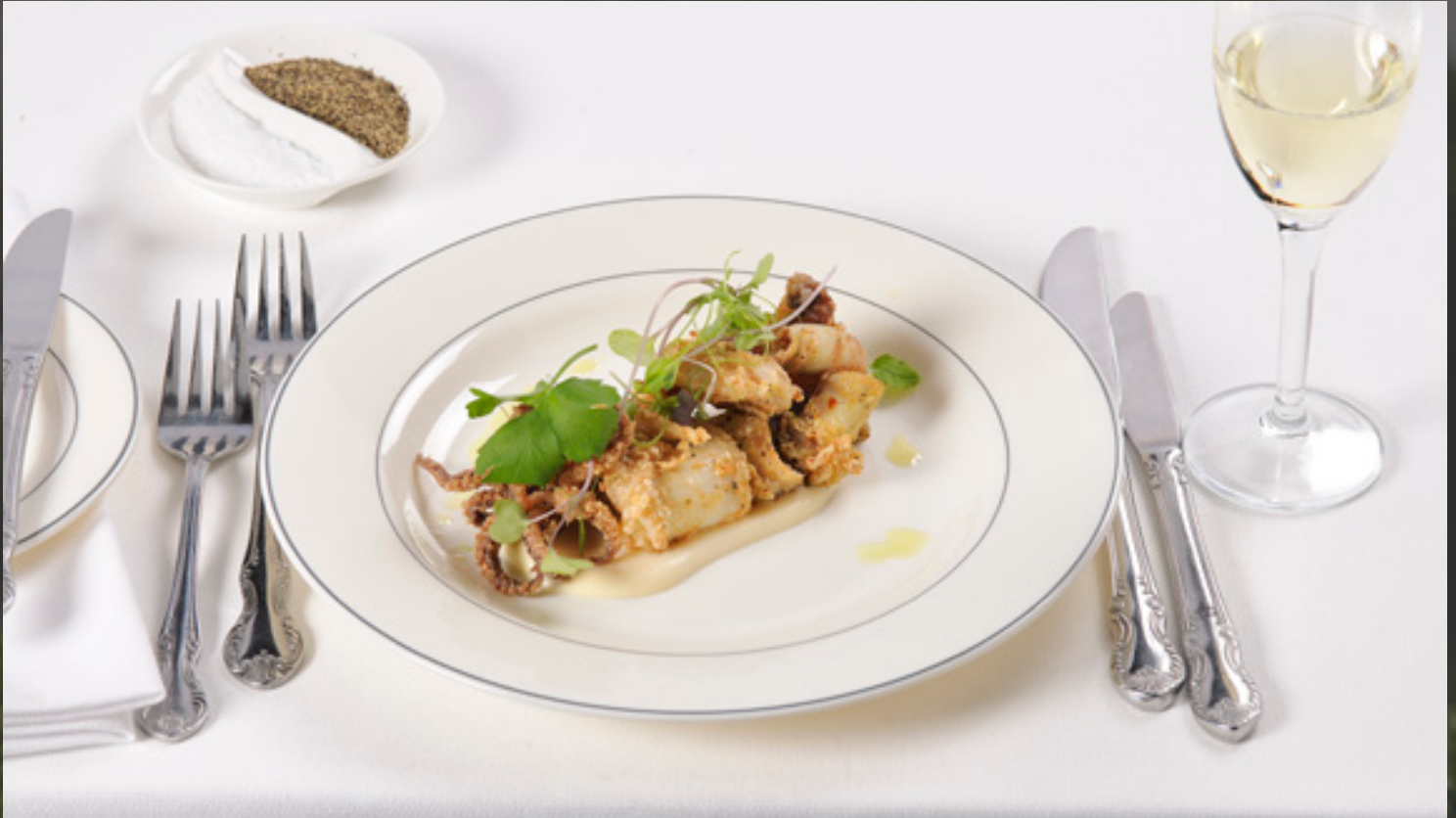
LEMON & PEPPER CALAMARI, LIME AIOLI AND ROCKET SALAD