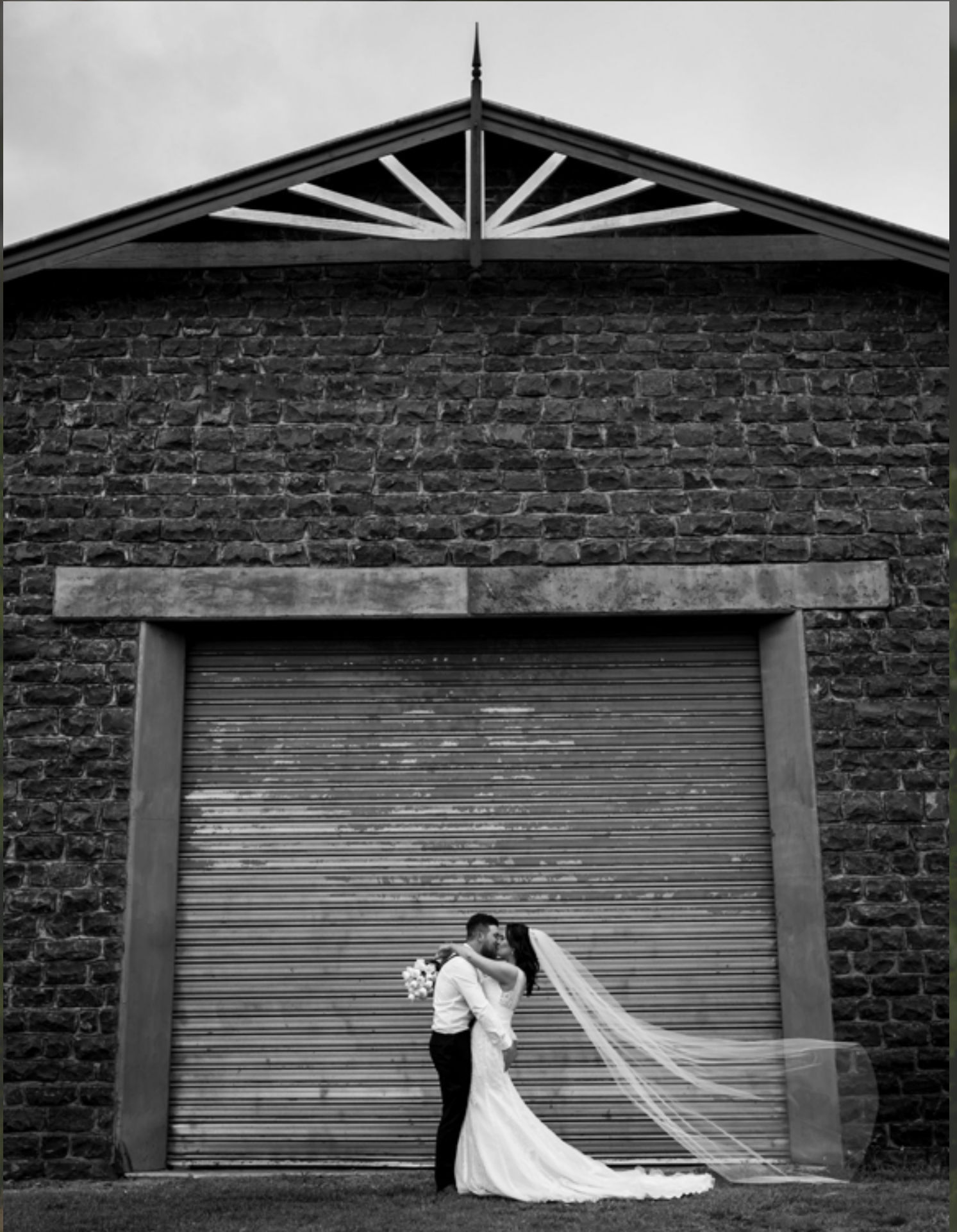
THE INDUSTRIAL LOOK