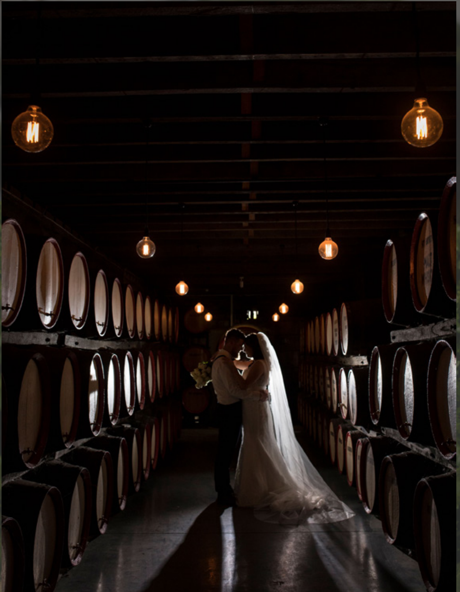
THE BARREL HALL; THIS ROOM SIMPLY OOZES CHARM