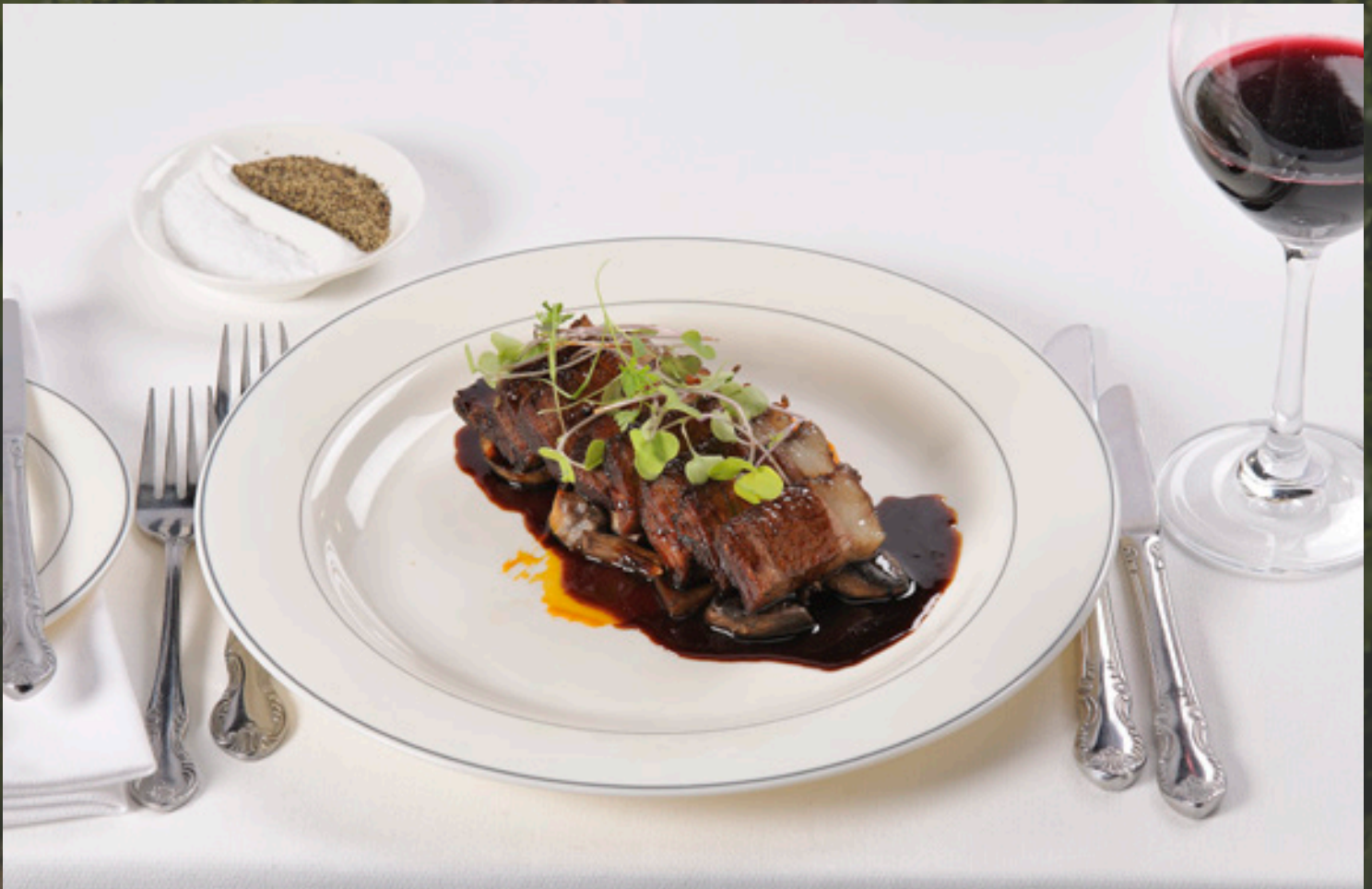
WAGYU BRISKET, SWEET POTATO PUREE AND SAUTÉED MUSHROOMS (GF)