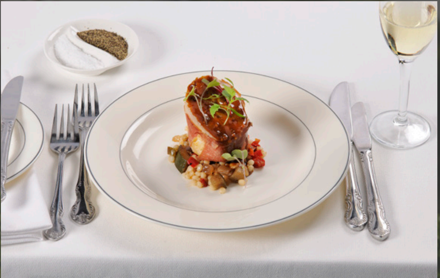
CHICKEN & PROSCIUTTO, STUFFED WITH MEREDITH GOATS CHEESE & THYME ON COUS COUS SALAD WITH A MUSTARD CREAM SAUCE.