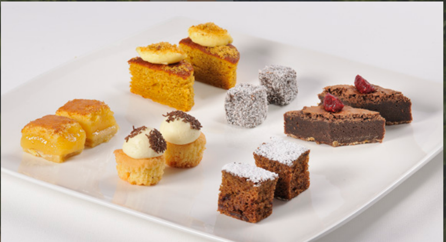
MIXED DESSERT PETIT FOURS