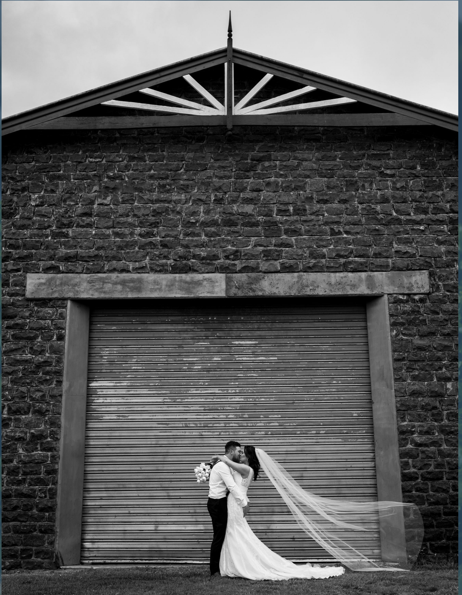
THE INDUSTRIAL LOOK