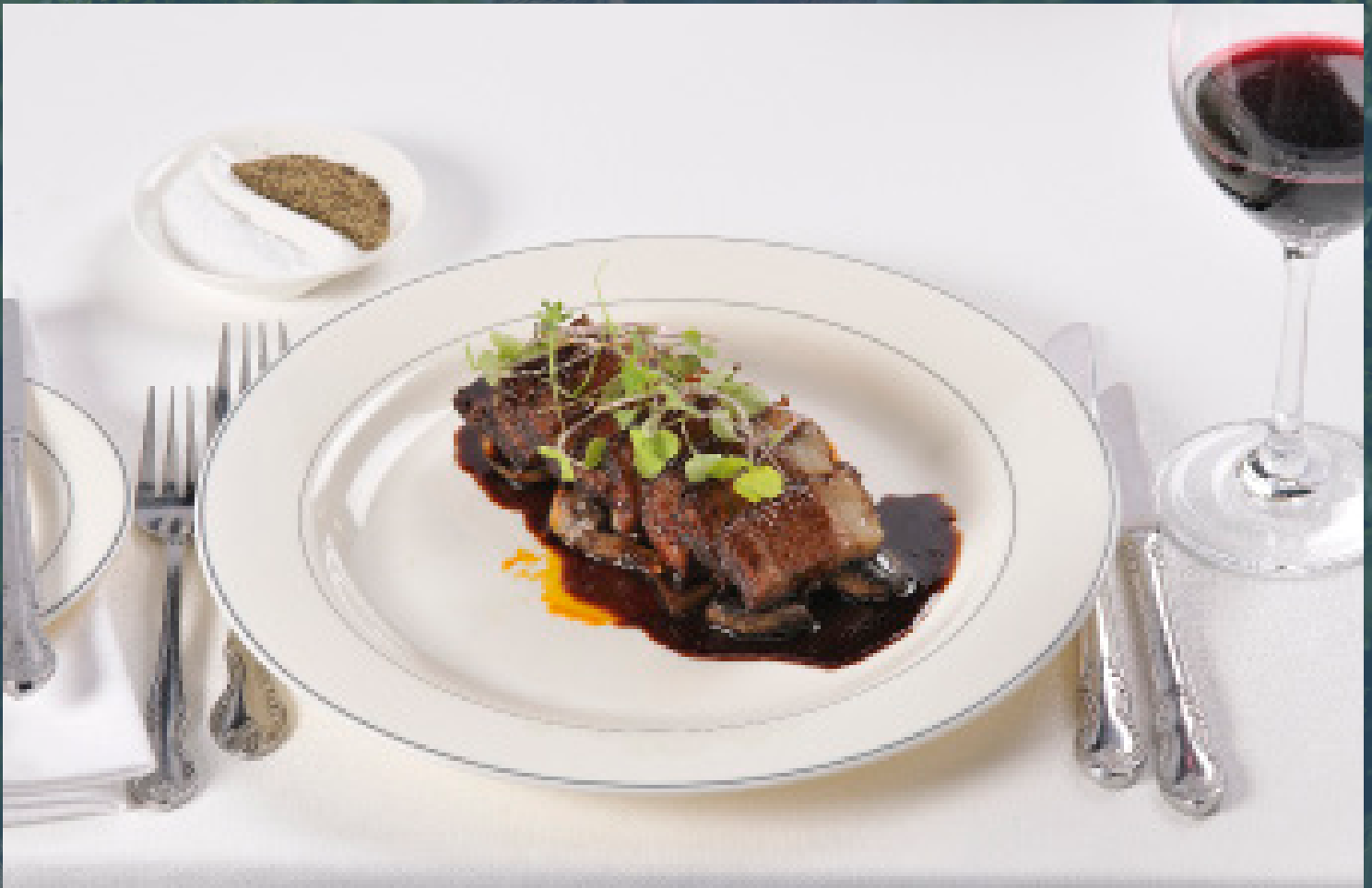
WAGYU BRISKET, SWEET POTATO PUREE AND SAUTÉED MUSHROOMS (GF)