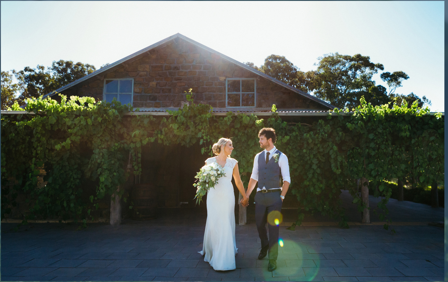
A BEAUTIFUL SUMMER DAY ON THE CHAPEL PATIO